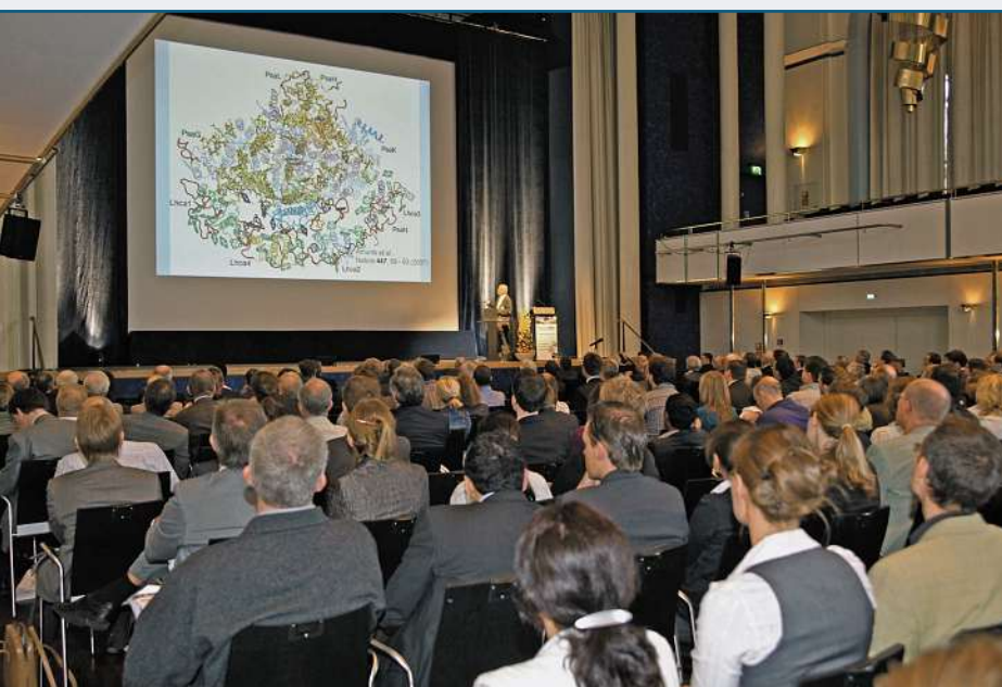
Full house at this year's meetings

The ProcessNet and Biotechnology Annual Meetings stand for continuity in the discussion of topics relevant to the process industries. Thus, this year's dominating topics provide an outlook to the questions currently addressed by the process industries that will also be discussed at AchemAsia 2011 when the global community meets in Beijing. ■