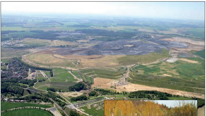
Refilled open cast mine and remediated site Ronneburg ( 2006 ) with BUGA exhibition area

On Thursday, September 6, we will start in Frankfurt and go by bus via highway A 4 to Chemnitz. We will make one stop in Ronneburg, where we will first reach one of the uranium mining areas of the Federal State of Thuringia. This area was characterised by underground and open-cast mining. Furthermore, different kinds of leaching processes were carried out here. A big leaching heap with about 14 m tonnes of low-grade ore was constructed and was in operation until 1990. The open-cast mine Lichtenberg was one of the deepest in Europe with a depth of 240 m. You will be informed about the ongoing comprehensive remediation work – the refilling of the open-cast mine and the prevention of acid mine drainage water formation as well as the water treatment plant. One part of the mining area is integrated in the German Federal Garden Exhibition 2007 (BUGA) which we will visit.