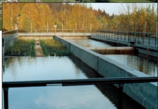
Pilot plant „Wetland Pöhla“ in 1999