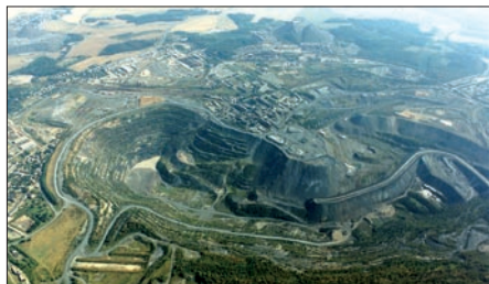
Open cast mine in 1991 (Lichtenberg)

We will continue the tour on Friday to visit one part of the mining area "Erzgebirge" and we will see the sites Pöhla and Schlema – Alberoda (Federal State of Saxony), where the deepest shaft of about 2000 m was in operation. You can see the treated piles and dumps and different water treatment plants of Schlema – Alberoda