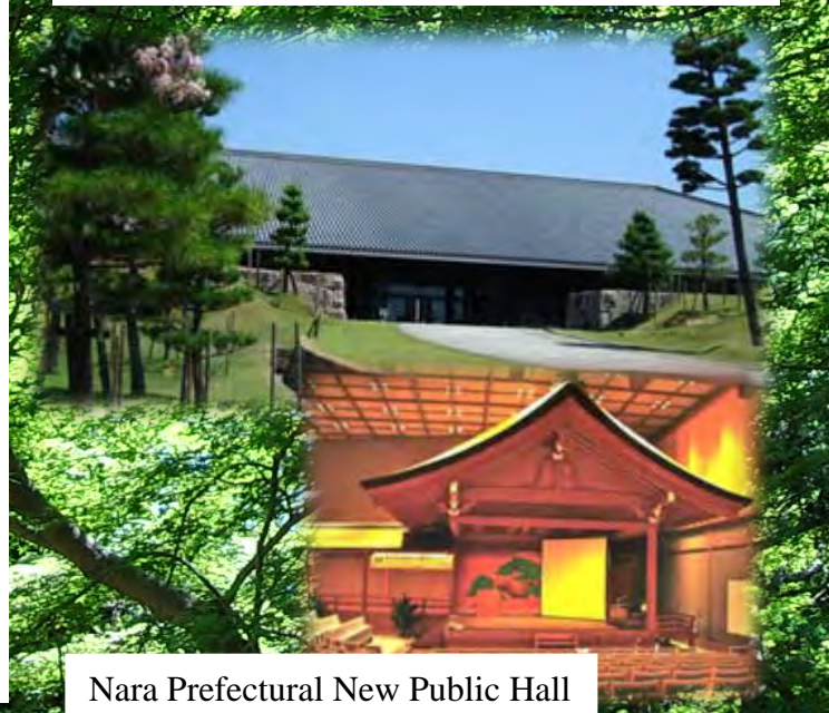
Nara Prefectural New Public Hall