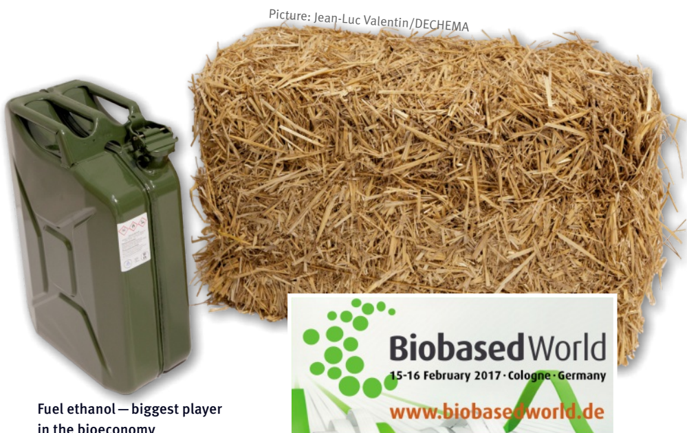
Fuel ethanol — biggest player in the bioeconomy

These growth rates also apply to the number of biobased products and processes on the market. However, if you are looking for an event where you would find all of the technological aspects of bio-refining in one place, you would be having a hard time. High time to launch BiobasedWorld, the first trade show dedicated to the bioeconomy. Whether you are engineering fermentation plants or